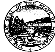
Brian Schweitzer Governor